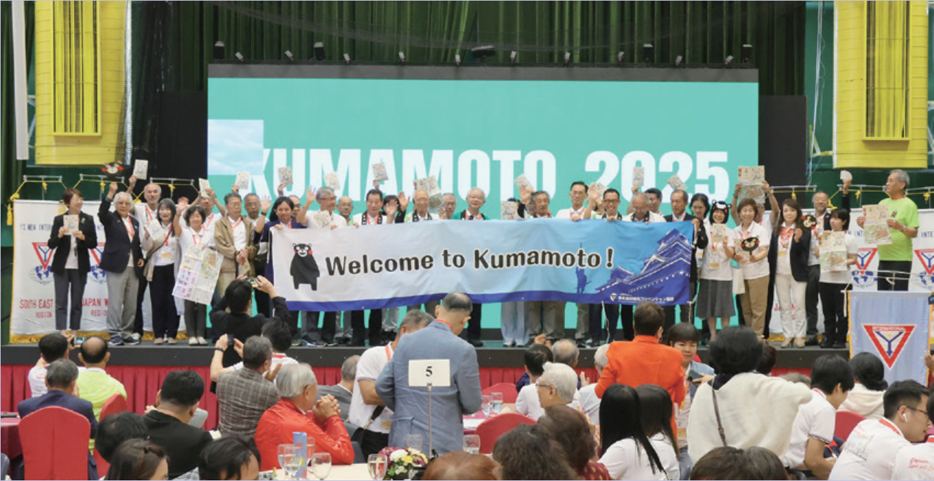
AC2025 Kumamoto, Japan Promotion