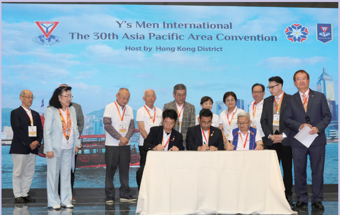
YMC Tokorozawa & Kawagoe, Japan and YMC Pangasinang, Philippine Signing IBC