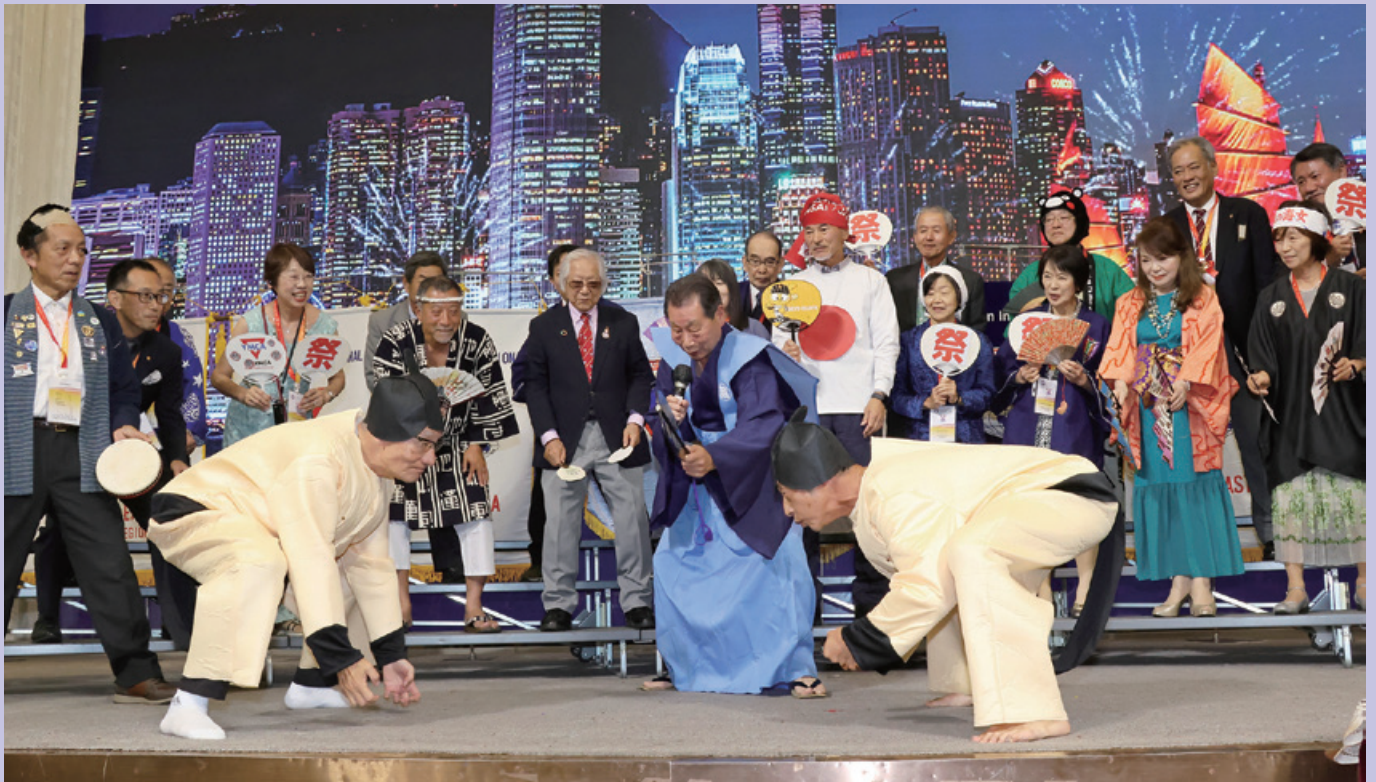
Sumo, Japan West Regional Performance