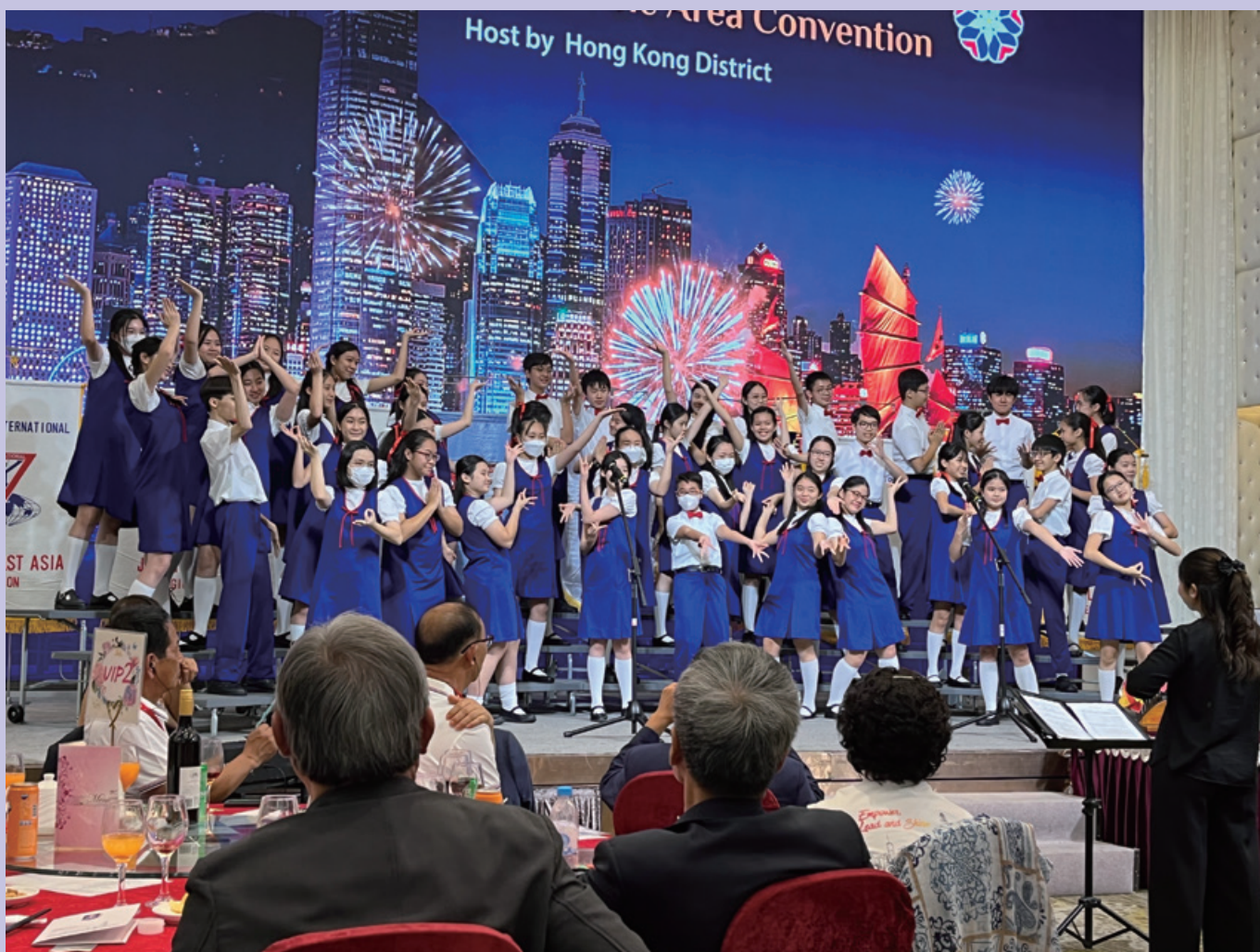
Hong Kong Children' s Choir