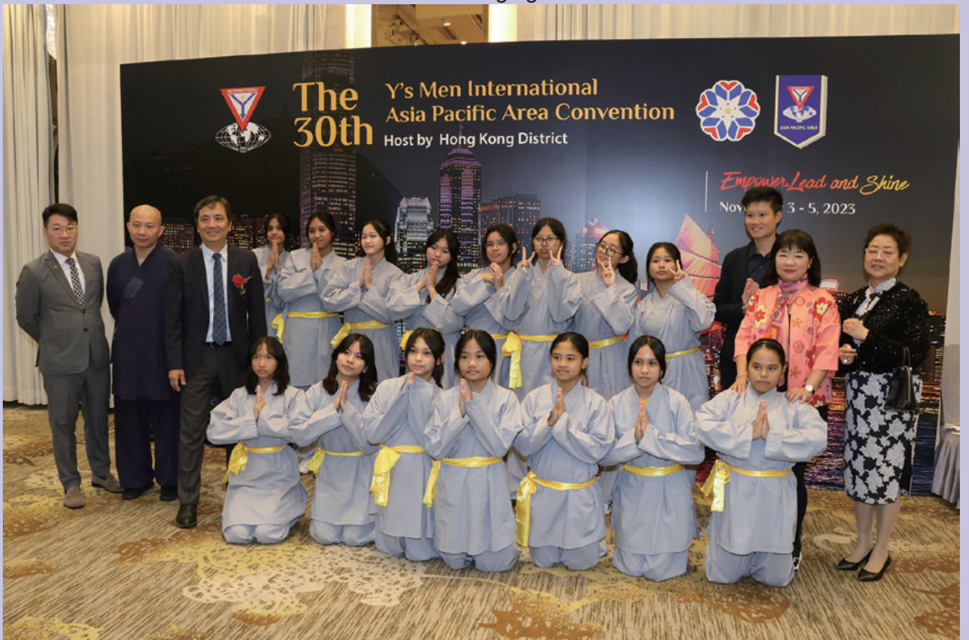
Shaolin Kung Fu Performance