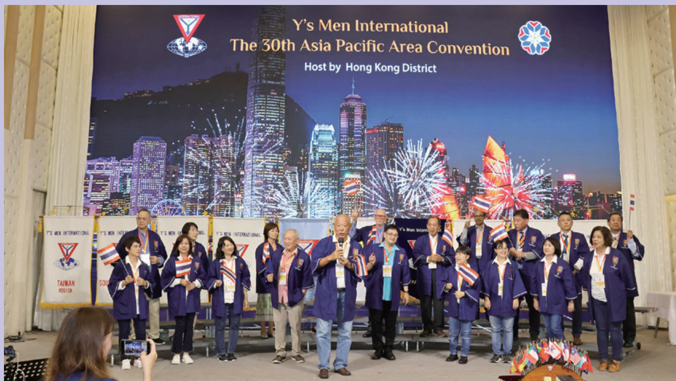
YMI Festival Promotion