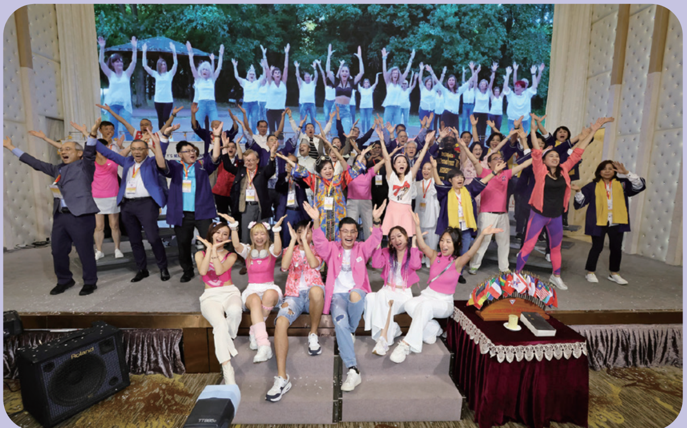
Dancing, Southeast Asia & Sri Lanka Regional Performance