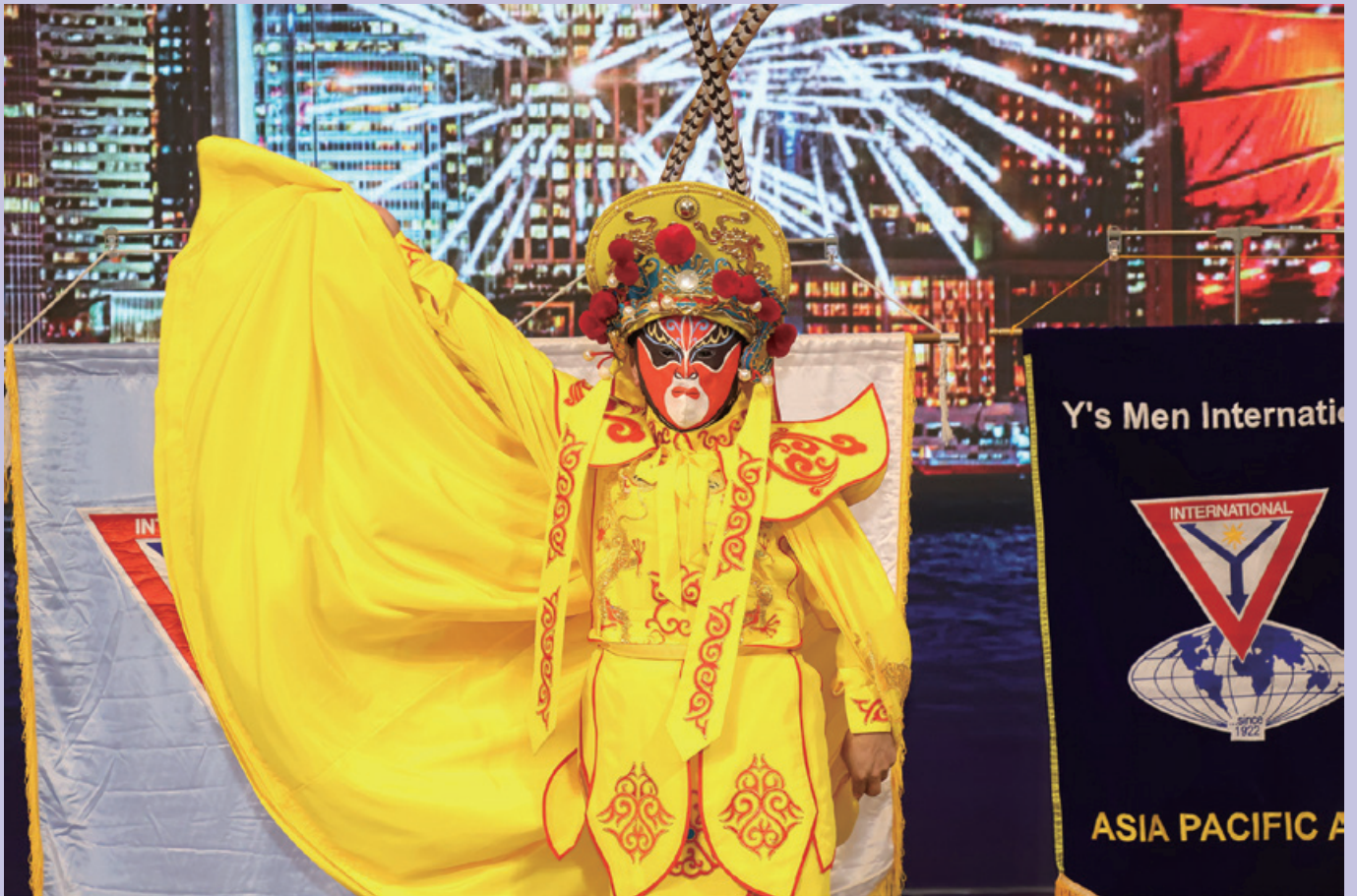
Si-Chuan Face-changing Performance