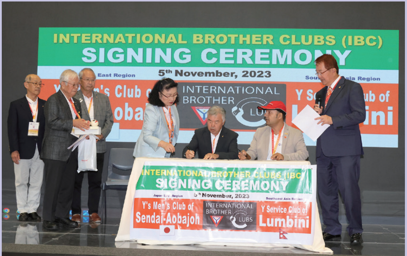
YSC Lumbini, Nepal & Sendai-Aobajoh, Japan Signing IBC