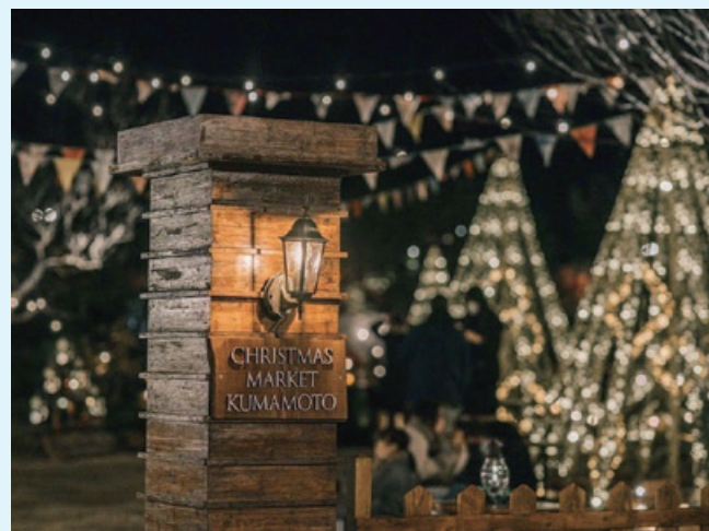
Christmas Market Kumamoto