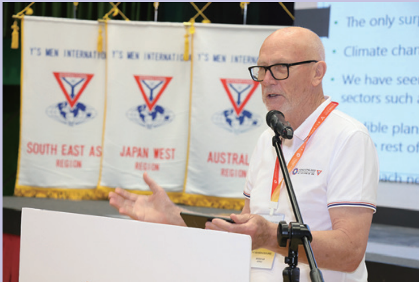
Fund Raising Appeal for Green Activities