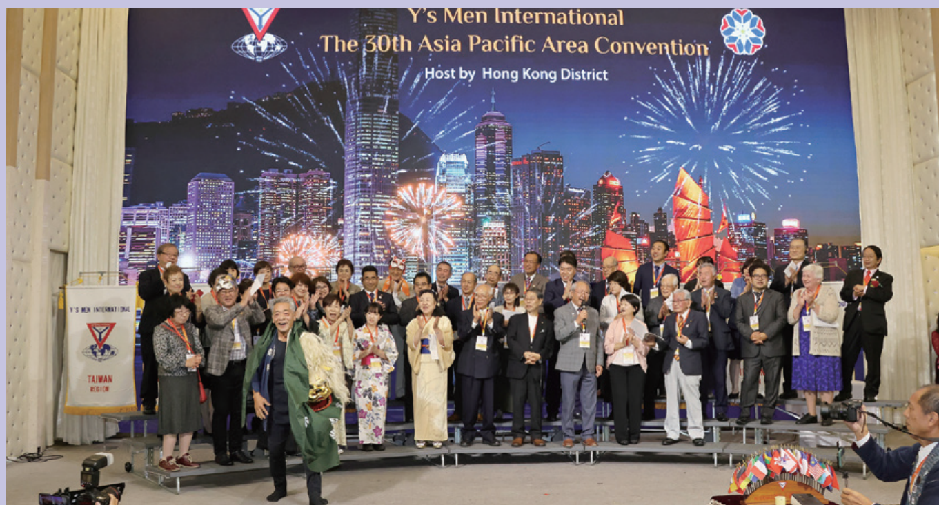
Shishimai, Japan East Regional Performance