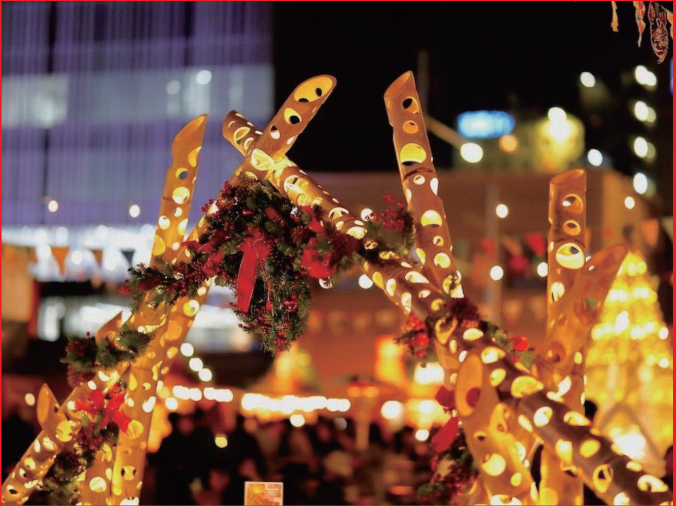
These Christmas decorative lights are made of bamboo.