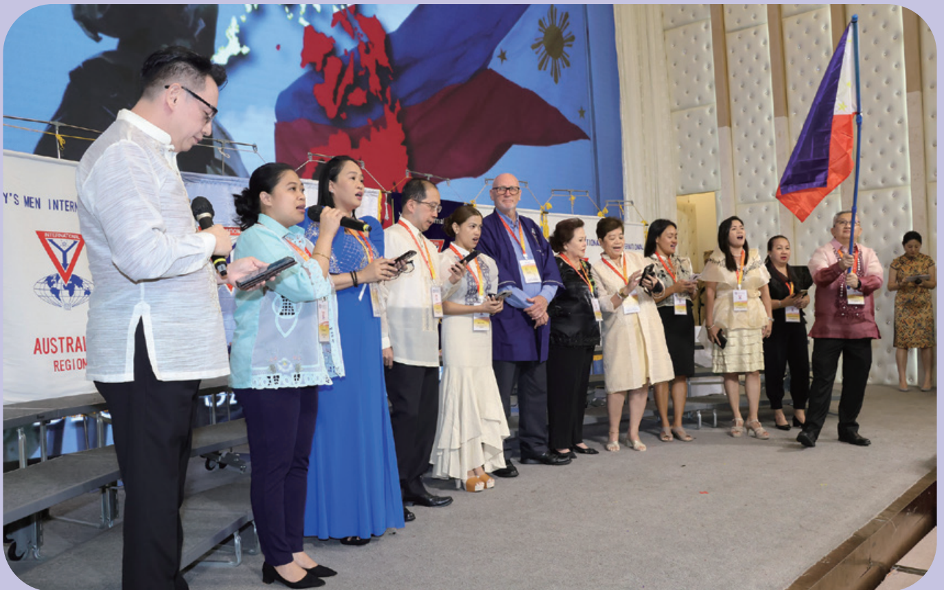
Singing, Philippine & Australia Regional Performance