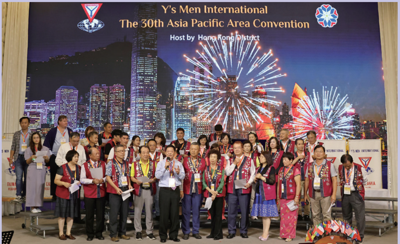
Singing, Taiwan Regional Performance