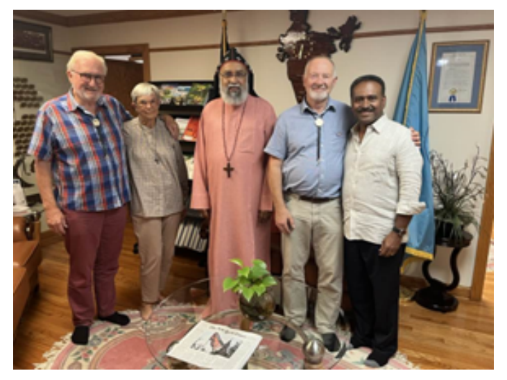
Visiting Long Island, New York and meeting the local bishop