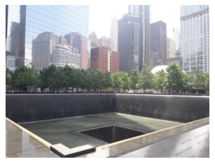
The 9/11 Memorial, New York

In March. I attended the YMI 100 centennial celebration in Taiwan. Α wonderful event and so well organised! At the same time we held the RDE Summit in the Taipei YMCA building. We are so fortunate to have this close partnership and enjoy the excellent facilities and hospitaliy of YMCAs around the world.