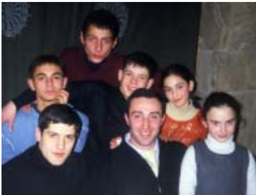
Leaders and the shelter house children

December 24. This is the date when the Tbilisi YMCA was established. This day is loved by everyone. Thanks to the administration of the Restaurant Dzveli Sakhli (Old House), who made it possible to celebrate this day in a warm and joyful atmosphere.