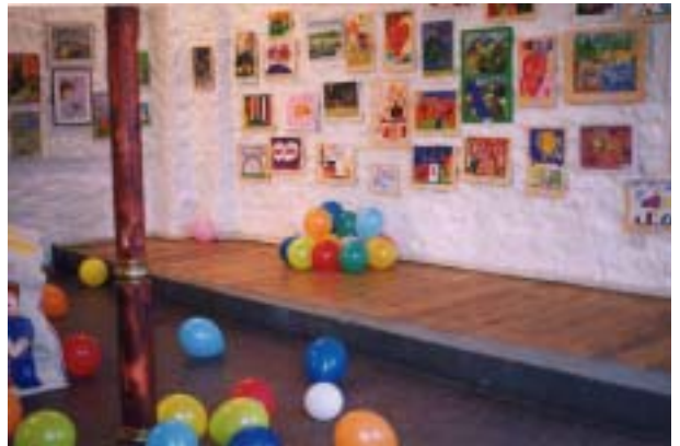
Exhibition hall before the opening

Since 1999, a coalition of NGOs from all over the world has recognized November 19th as the "World Day for the Prevention of Child Abuse." Worldwide, this day has been administered by the Women's World Summit Foundation (WWSF) based in Geneva, Switzerland. The Tbilisi YMCA became the member of this coalition in 2002 and since that time has launched various activities throughout the city. This year, this day was recognized with an international children's pictures exhibition at the Chardin Gallery located at 12, Chardin Street, Tbilisi, Georgia. The event was held in cooperation with a local NGO – NGG and with the support of Students Union of the Georgian Technical University.