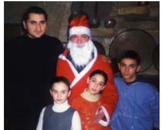
Santa Clause with the kids

By the end of the party, Santa Clause with a large bag of presents appeared in the hall. This was very much unexpected by the children and they became even happier than before. Celebrations concluded with the distributed of presents to the kids.